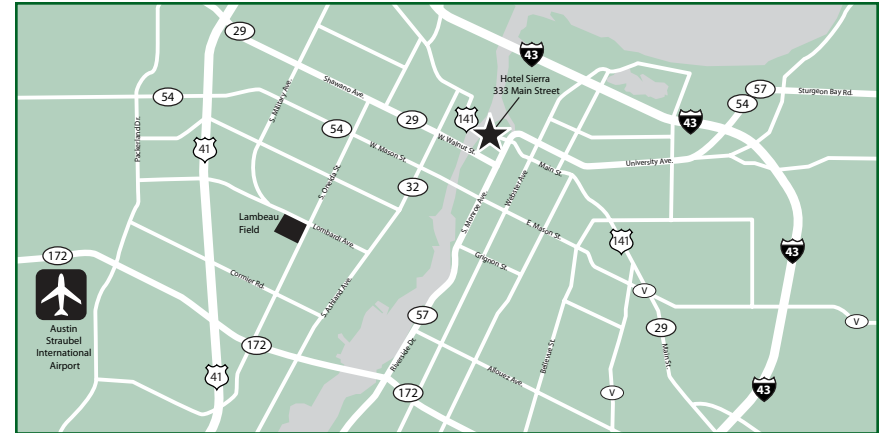
Green Bay Street Map